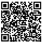
Map of all-gender restroom locations across campus